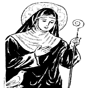
St. Scholastica, Virgin